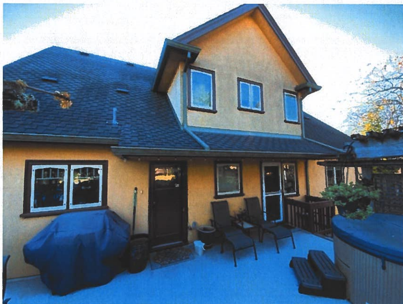
All stucco at the back of the house