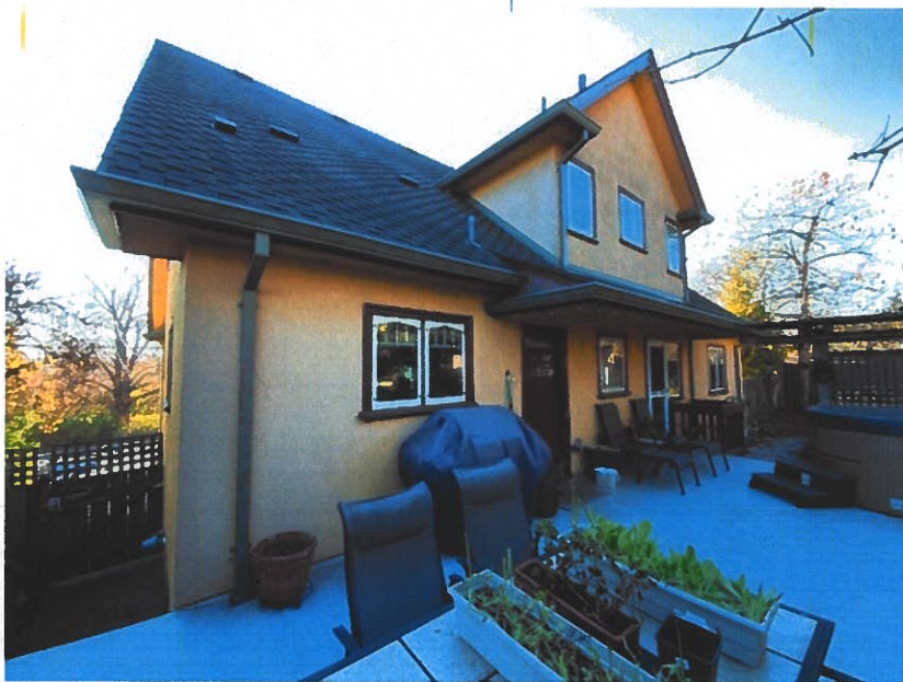
Includes the stucco soffits and both sides of the dormer.